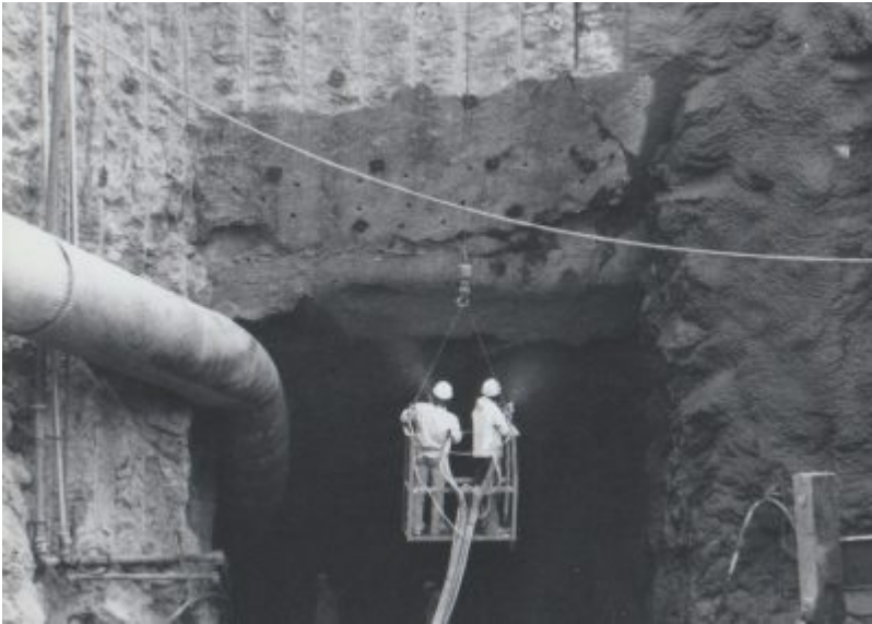
Explosion Test Site – Caronport, SK