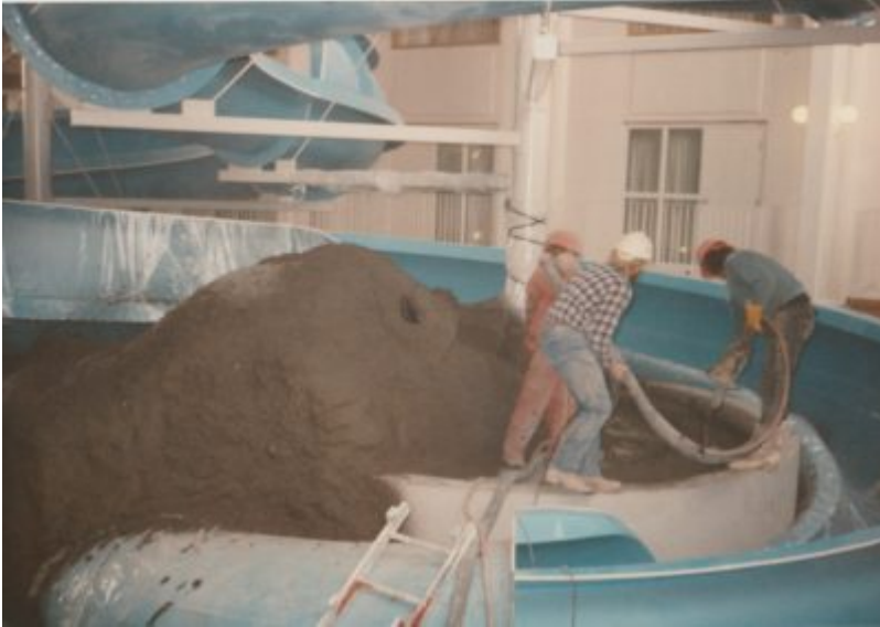
Flin Flon Trout Lake Mine Rock Stabilization