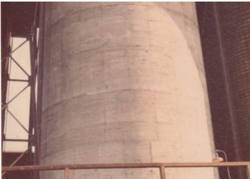
Pasqua Hospital Trimming Cut Off Walls